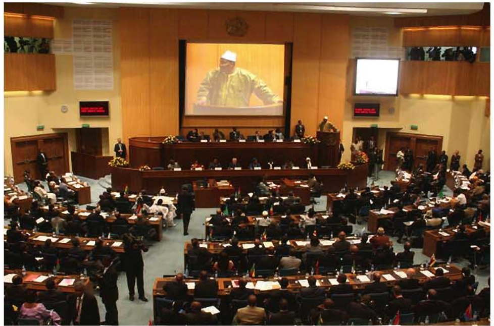
UN secretary-general Ban Ki Moon (top left); inside the UN conference hall; Libyan President Muammar Gaddafi (bottom right); Zimbabwean President Robert Mugabe (bottom left).