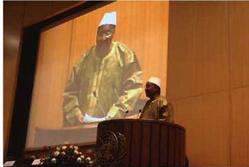
African Union chairperson Alpha Oumar Konare addressing African presidents at the United Nations conference hall yesterday.