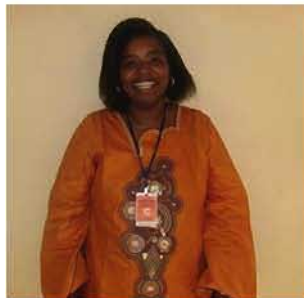
Monica Juma (left)

Dr. Monica Kathina Juma from Kenya is a candidate for the Commissioner of the Peace and Security Council to the AU. With an extensive background in matters of peace and security in Africa, Dr. Juma is currently the Executive Director of the Africa Policy Institute.